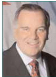
Chicago Mayor Richard Daley to address Summit.

The line-up of speakers is among our most impressive and includes a morning keynote by Dr. Richard Carmona, the 17th US Surgeon General and Tucson resident, who is uniquely qualified to talk about the impact of the environment on health and wellness.