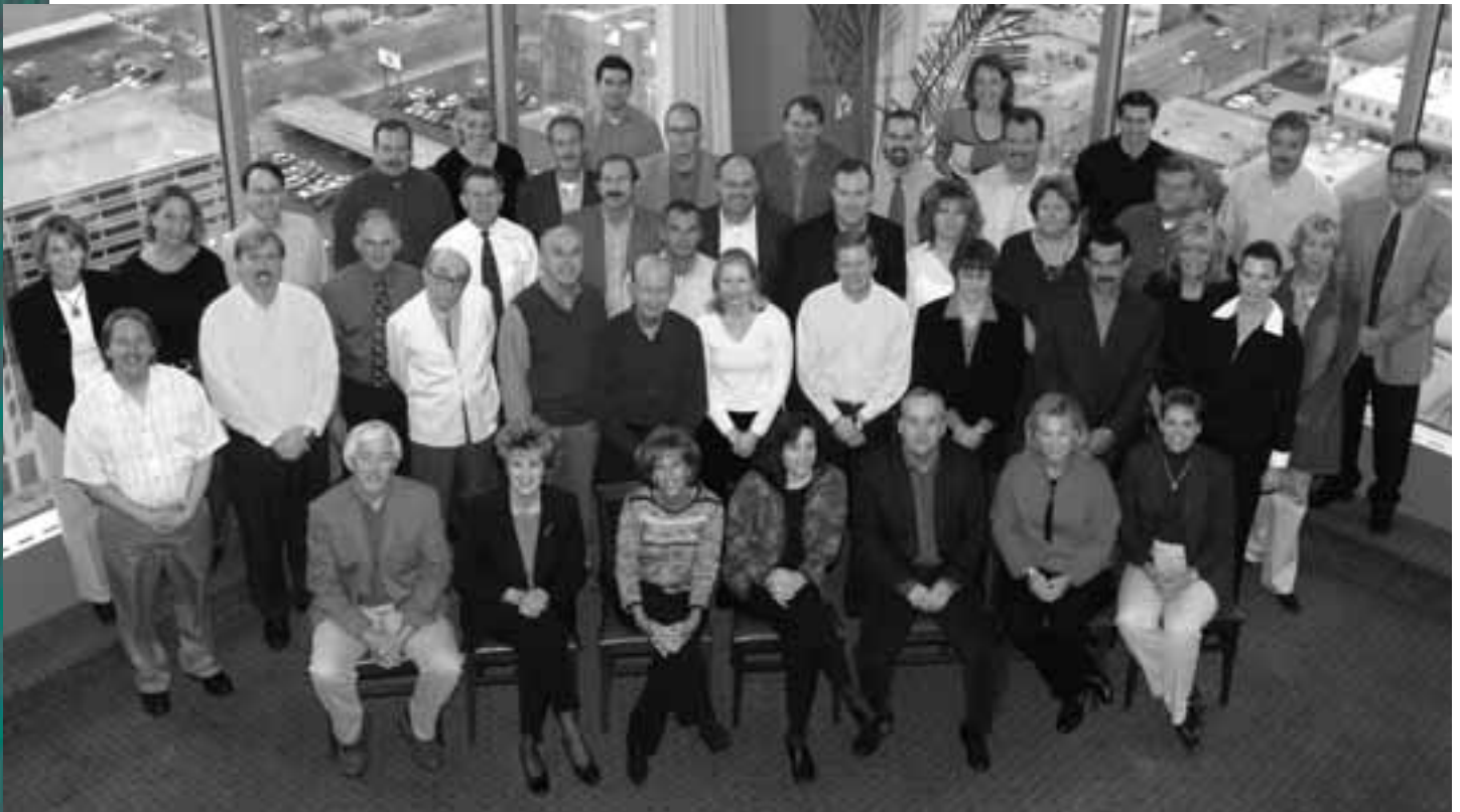
2004 Board of Directors – Valley Forward's Board of Directors assemble for an annual retreat in November to discuss a successful 35th anniversary year and how to continue the momentum through newly created programs and organizational changes.