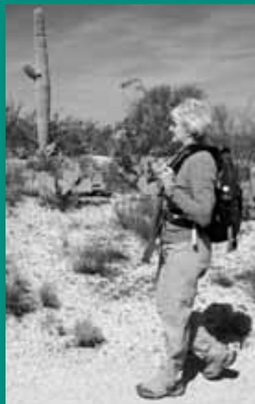
CREATING A PEDESTRIAN FREEWAY – In celebration of National Trails Day (June 6) Valley Forward produced and distributed a poster illustrating the need to link Valley communities and landmark destinations. Called “The Valley’s Pedestrian Freeway – A Priceless Necklace of Trails and Gems,” the project was unveiled at a public hiking event in partnership with the City of Phoenix and was supported in a proclamation signed by virtually all Valley mayors and the Maricopa County Board of Supervisors. VFA also created and distributed a set of regional trails design principles.