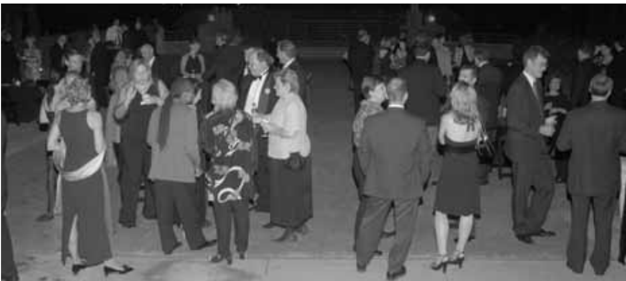
POST EVENT CELEBRATION – Valley Forward hosted a post event cocktail reception following the banquet to enable attendees to personally congratulate award winners.