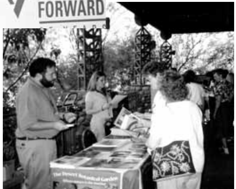
EARTHFEST EDUCATORS NIGHT – More than 200 teachers attended Valley Forward’s EarthFest Educators Night featuring 50 displays on environmental education resources. They networked, enjoyed complimentary refreshments and received an environmental education poster created by Valley Forward for use in classrooms. The poster was distributed to 1,000 teachers throughout Arizona.