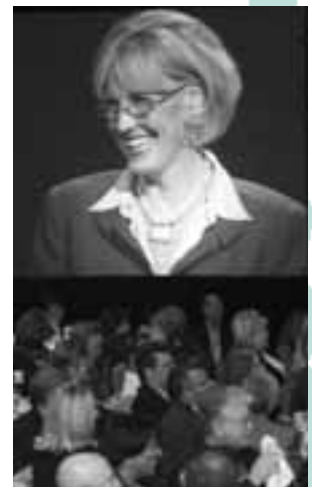
CAPTIVATING – Erin Brockovich captivated her audience with stories both humorous and tragic about her life, the movie that bears her name and what’s keeping her busy currently.